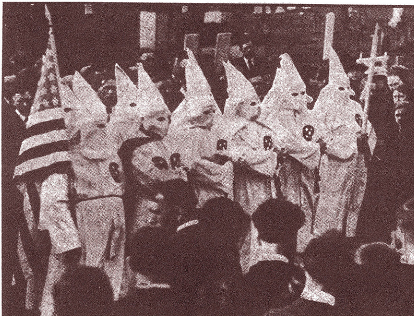
THE FIRST KU KLUX FUNERAL IN THE NORTH,

In Reading, Ohio. The regalia, American flag and cross are clearly pictured.